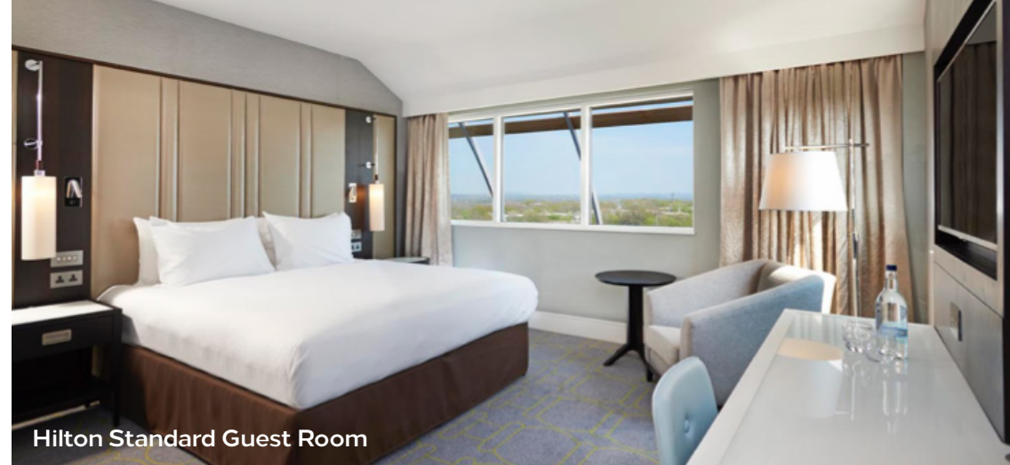
Hilton Standard Guest Room

We're pleased to extend a special 15% discount off our best available rates exclusively for your guests (subject to availability). Upon confirmation of your special day a unique booking link will be sent to facilitate hassle-free reservations.